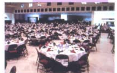
South Exhibition Hall