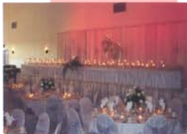
South Hall Ballroom