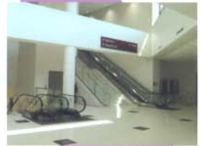
South Hall Lobby